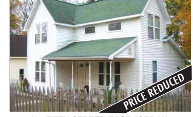
105 FIFTH STREET, EAST JORDAN Style, charm and location! This home has it all as well as a very recent updates. Back yard is fenced in for convenience. MLS 435249. Ask for Jennifer Burr. $99,900