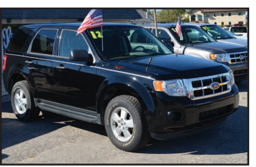
2012 FORD ESCAPE 4 new tires. AS LOW AS $239 A MONTH