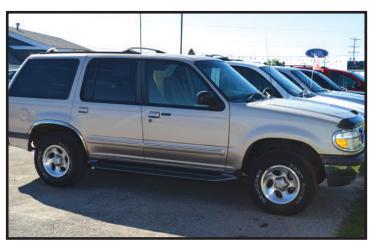
1998 FORD EXPLORER XLT 4x4, air, cruise. BUY FOR ONLY $2,995