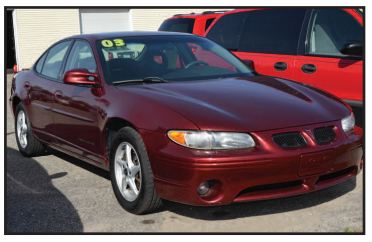
2003 PONTIAC GRAND PRIX Air, cruise. AS LOW AS $149 A MONTH