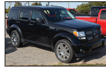
2011 DODGE NITRO Heat package, 4x4. AS LOW AS $279 A MONTH