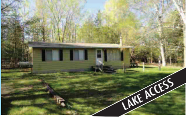
03653 COMMODORE DRIVE, EAST JORDAN Friendly community with private boat slips, sandy beach and family picnic area. Three BR, 1.5BA w/ Lake Charlevoix access! MLS 436953. Ask for Mike Stark. $106,900