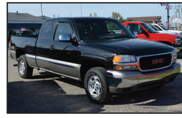
2002 GMC SIERRA SLT 4x4, V-8, leather, loaded, seats 5. AS LOW AS $225 A MONTH