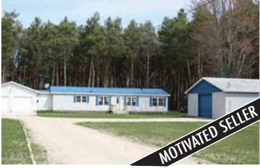
6721 FAIR ROAD, EAST JORDAN Located on 10 acres close to town, beautiful master suite, plus 2 car attached garage with a bonus 28x32 out building. MLS 436868. Ask for Holly Nierman. $112,900