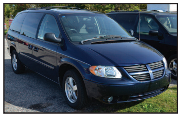
2005 GRAND CARAVAN SXT 4 captain's chairs, seats 7, air, cruise. AS LOW AS $149 A MONTH