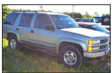
2000 CHEVY TAHOE Z-71 Leather, 4WD, tow pkg, low miles. $5,995 • $599 DOWN