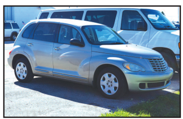
2006 CHRYSLER PT CRUISER Air, cruise. BUY FOR ONLY $6,995