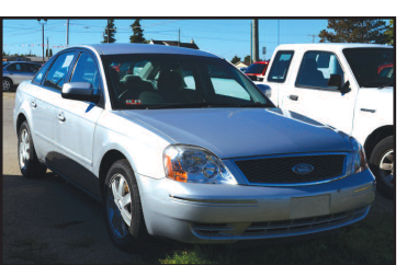
2005 FORD 500 Air, cruise, 4 new tires, Pioneer stereo. $7,995