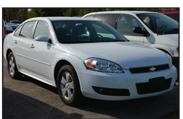
2011 CHEVY IMPALA Air, cruise, nice car. 29 MPG. AS LOW AS $225 A MONTH