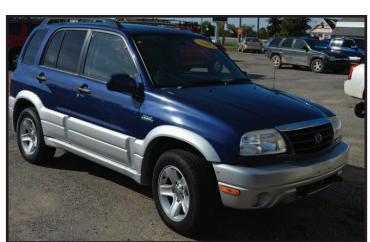
2003 SUZUKI GRAND VITARA SUV Climate control, cruise, air, AWD. AS LOW AS $149 A MONTH