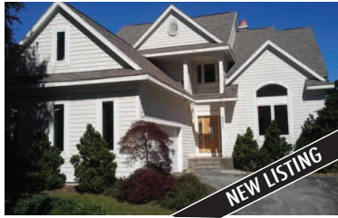
4972 WILDWINDS DRIVE, BAY HARBOR Beautiful 4000+sf home in Bay Harbor on the golf course. Elegantly appointed with hardwood floors & granite counters. MLS 438461. Ask for Mike Stark. $359,000