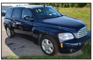
2010 CHEVY HHR Air, cruise, nice. BUY FOR ONLY $9,900