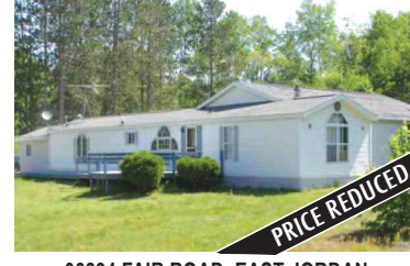
06834 FAIR ROAD, EAST JORDAN Well maintained mobile with two large additions. Includes 30 x 30 detached garage and a 30 x 30 pole building on 13+ acres! MLS 434955. Ask for Jennifer Burr. $63,000