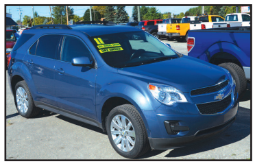
2011 CHEVY EQUINOX LT. AWD Very nice. AS LOW AS $249 A MONTH