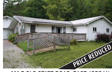
933 E OLD STATE ROAD, EAST JORDAN 3BR, 1.5BA on 27 wooded and rolling acres. Here's your chance to put your personal touches on a home with acreage. MLS 437970. Ask for Holly Nierman. $69,999