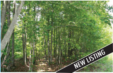
TBD AUNT FERNS DRIVE, EAST JORDAN Great 10 acre parcel, this would make a great place to build a home or just a get away for deer camp. MLS 438227. Ask for Holly Nierman. $15,000