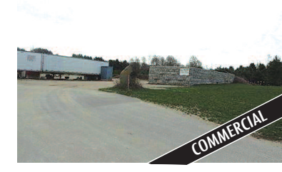
112 BARTLETT STREET, EAST JORDAN Commercial property right in town with a convenient location. Zoned C2, currently used as a trucking yard. Driveway in place. MLS 436755. Ask for Jennifer Burr. $40,000

109 MILL STREET • EAST JORDAN • 231-536-7700 STARKREALTYMI.COM