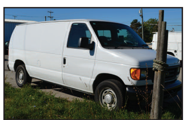
2005 FORD E-150 CARGO VAN. Great deal. $4,995

989 VFW RD., CHEBOYGAN, MI • 231-627-6700 • WWW.RIVERAUTO.NET