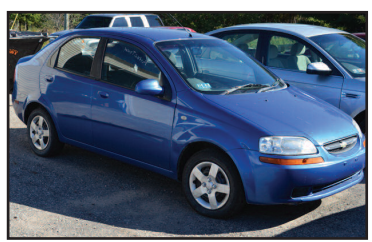
2005 CHEVY AVEO LS Auto, air, 35 MPG. BUY FOR ONLY $5,895