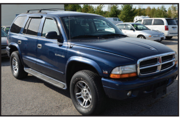
2002 DODGE DURANGO 4x4, 3rd row seat, leather. AS LOW AS $199 A MONTH