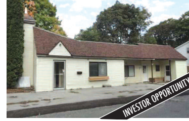
233 CEDAR STREET, BOYNE CITY Tri-plex with excellent rental history. All three units have had many updates. There is a 3 BR 2 BA, and two, 2BR, 1BA. MLS 435092. Ask for Jennifer Burr. $115,900