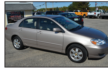
2003 TOYOTA COROLLA LE Sunroof, air, cruise. AS LOW AS $149 A MONTH