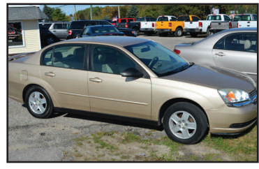
2005 CHEVY MALIBU LS V-6, air, cruise, clean. AS LOW AS $149 A MONTH