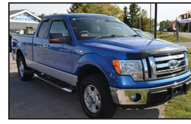
2010 FORD F-150 XLT 4x4, tow pkg. BUY FOR ONLY $19,999