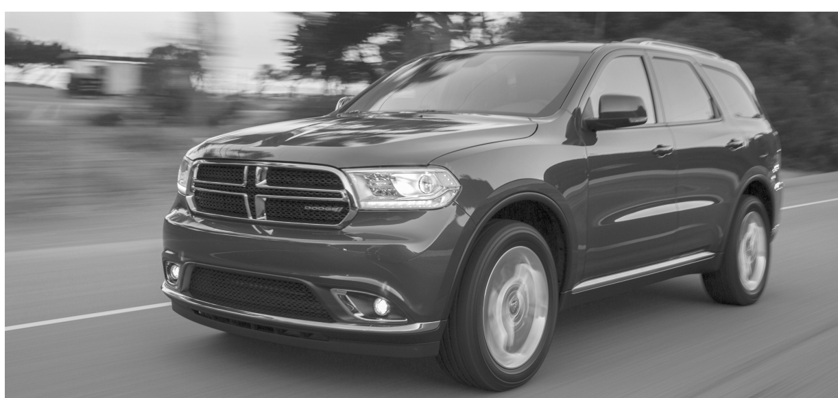
The Dodge brand is upping the ante in the fast-growing full-size sport-utility vehicle (SUV) and crossover segments with the introduction of the new 2014 Dodge Durango.