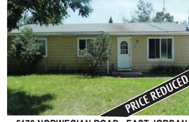
5178 NORWEGIAN ROAD., EAST JORDAN Nice ranch style home just outside of town. Call to schedule a showing today! MLS 437559. Ask for Jennifer Burr. $55,000