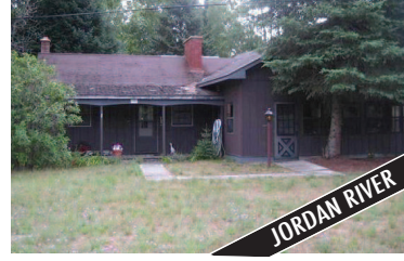
2452 MARTINSON DRIVE., EAST JORDAN Fantastic home and location with access to the river and snowmobile trails. Beautiful frontage on the famed Jordan River. Pole barn for extra storage. MLS 435491. Ask for Mike Stark. $159,900.