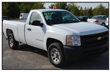
2007 CHEVY SILVERADO 4x4, tow pkg. AS LOW AS $199 A MONTH